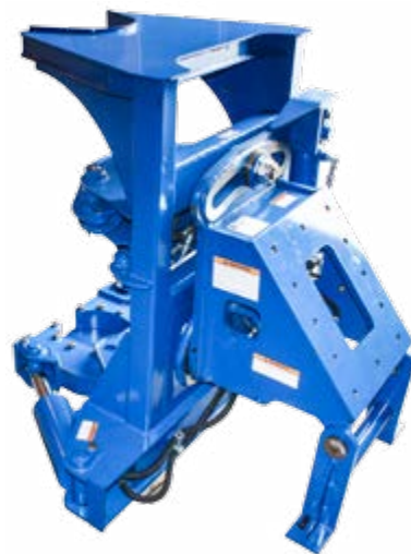
Optional 35° tilting interface

If your machine is only equipped with a single circuit, Dymax can provide an electro-hydraulic diverter valve to operate from the existing circuit to power the tilt function.)