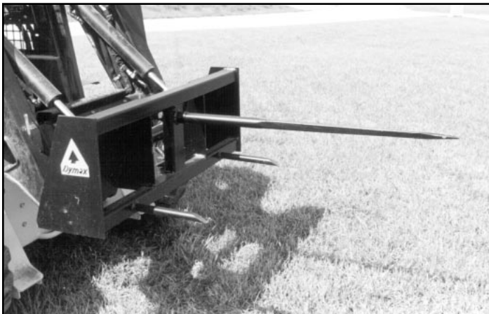
Bale Spear with single 44" spear.