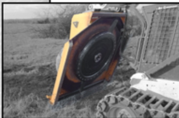
(Left) The Dymax Vortex destroys everything in its path, its manufactured with a 750 lb fly wheel that spins at 950 rpm.